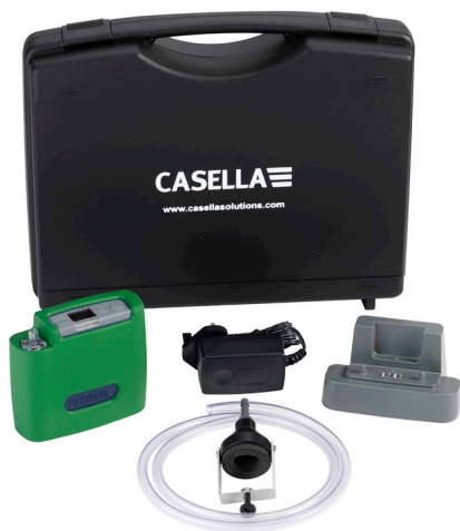
The Flow Detective™ is available as a kit with a sturdy carry case