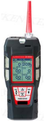
Six Gas Aspirated